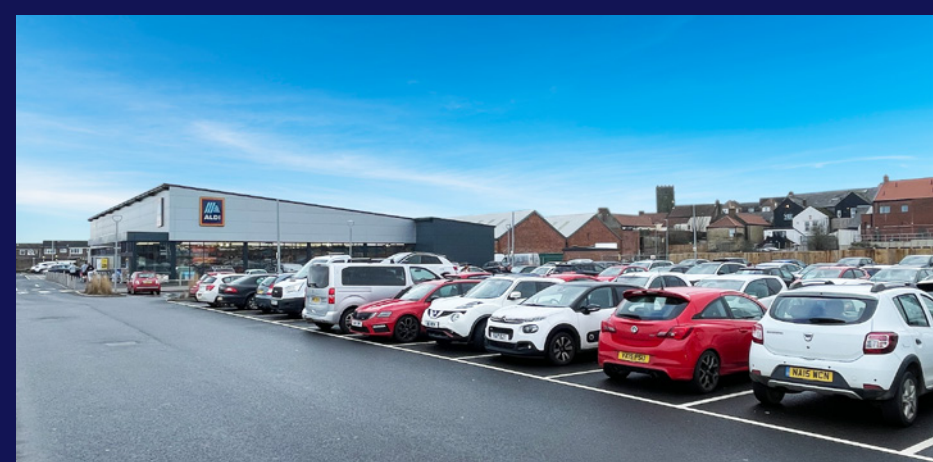
ALDI and car park