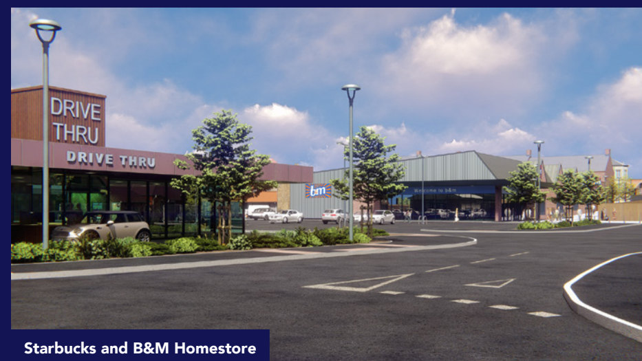
Starbucks and B&M Homestore